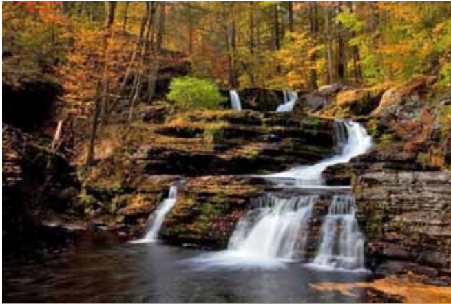
A waterfall on Dingmans Creek in the Delaware Water Gap National Recreation Area.

By the 1930s, residents and local decision-makers began to act to clean up and protect the Delaware basin. A commission created in 1936 to clean up stream pollution facilitated construction of new sewage treatment plants and began to remove coal silt from the Schuylkill River to tackle pollution from coal mining and processing. But by the 1950s, the urban reach of the Delaware River was one of the most polluted stretches of river in the world. 20 In response, state and federal leaders created the Delaware River Basin Commission in 1961 to address land use, water use and water quality as part of one interconnected system.