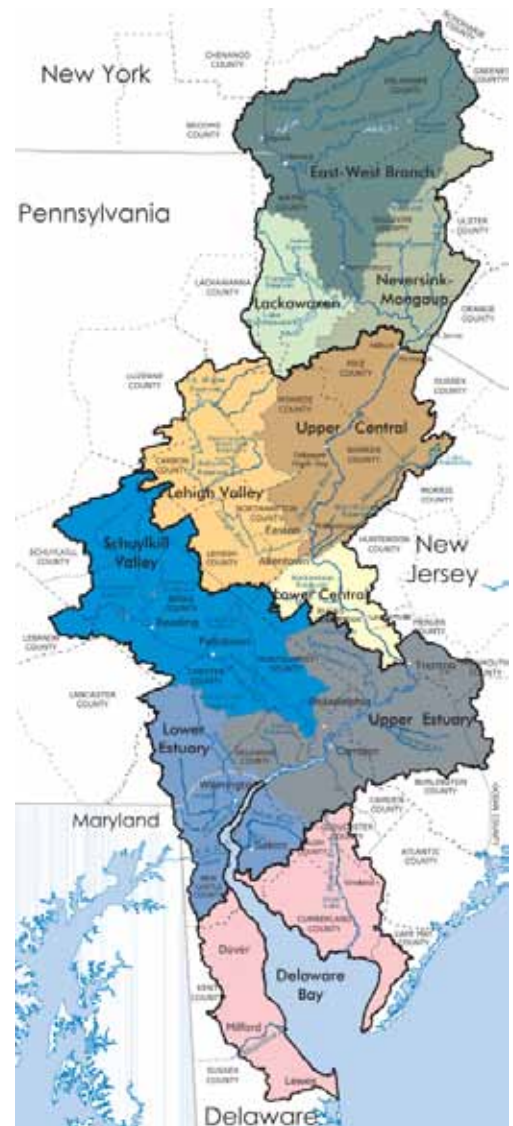
Figure 1. The Delaware River Basin Spans Four States and Supplies Water to More Than 15 Million People 14

The beauty and importance of the Delaware have not kept polluters along its banks from fouling the river in ways that harm wildlife and human health. For centuries, waterways in the Delaware River Basin were severely polluted. 17 The first survey of pollution in the river, conducted in 1799, recognized that tanneries, slaughterhouses and harbor areas were sources of pollution that caused disease, like typhoid outbreaks in the 1860s. 18 Intense development and use of the river system, population growth and industrial expansion all further contributed to pollution, leading to the collapse of the historic shad fishery, among others. 19