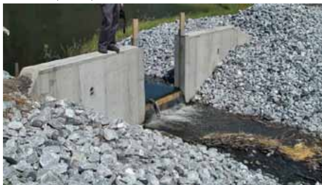
Treated water exiting the Silver Creek acid mine drainage treatment system.